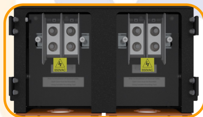
Main Terminal Arrangement