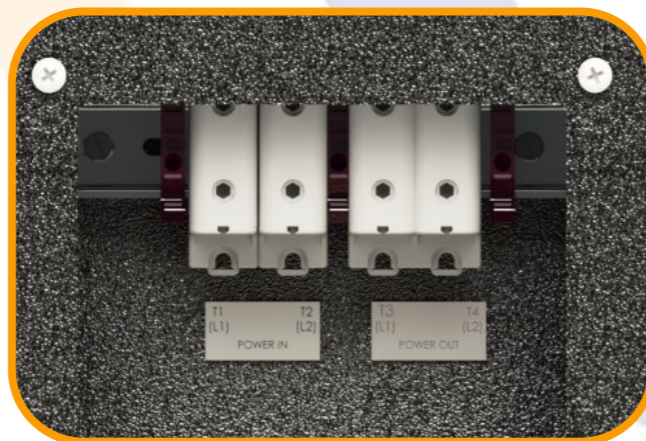
Main Terminal Arrangement