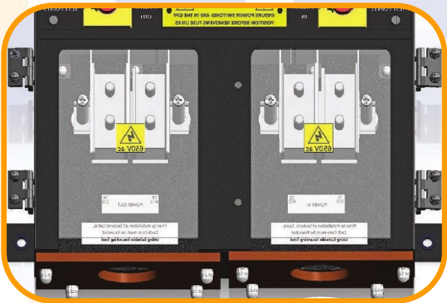
Main Terminal Arrangement