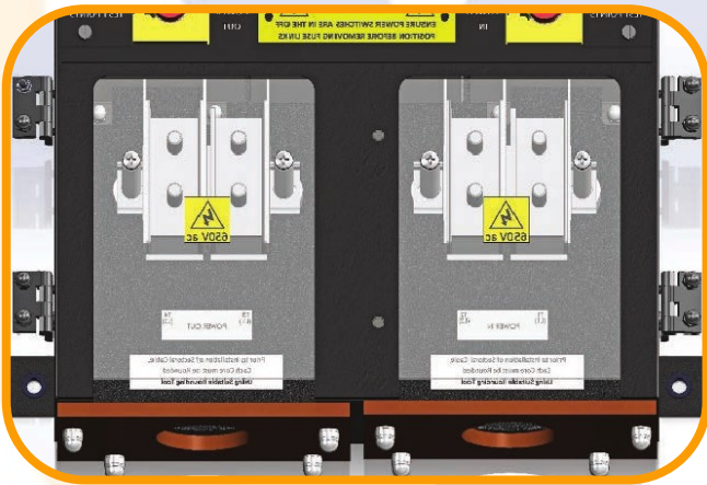
Main Terminal Arrangement