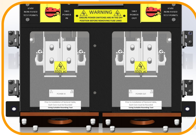
Main Terminal Arrangement