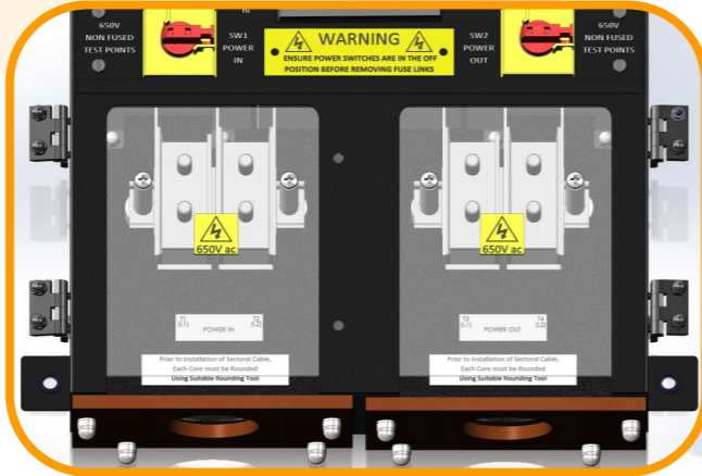
Main Terminal Arrangement